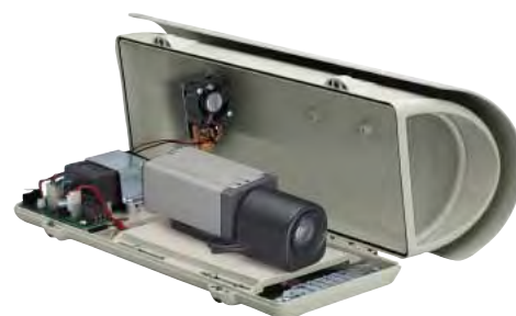
VERSO + CAMERA