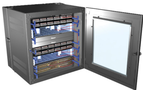
Figure 1: Application of a horizontal slack manager and bend radius posts installed in a wall mount cabinet