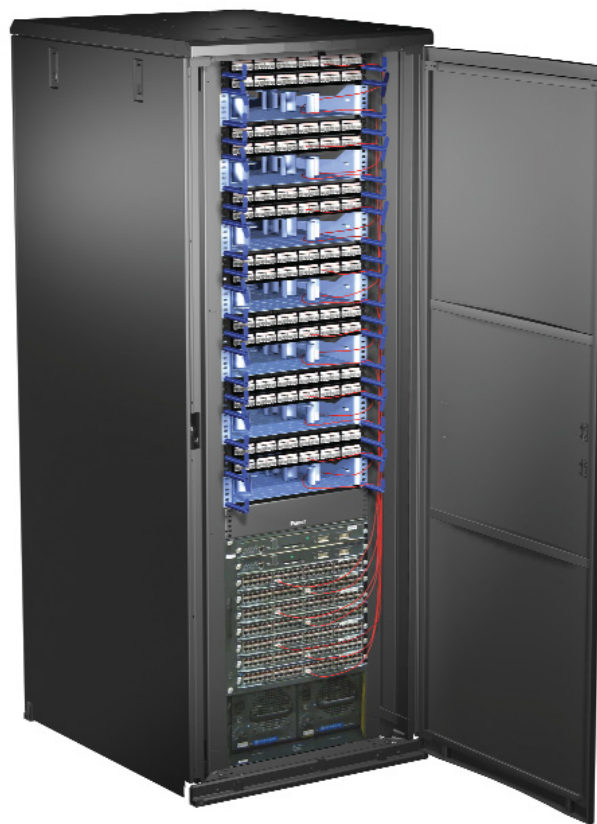
Figure 2: Application of a horizontal slack manager and bend radius posts installed in a full size cabinet

Dimensions are in inches [Dimensions in brackets are in millimeters]