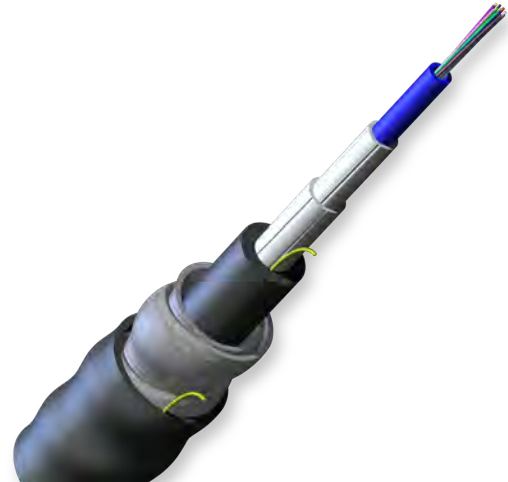
Part Number: 012TSF-T4131DA1