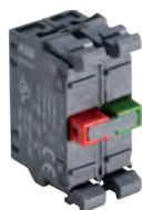
Double Contact Blocks