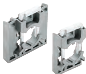
Holders for Contact Block