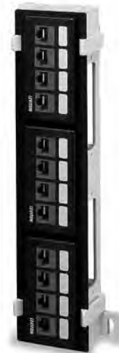
Pictured: QuickPort 12-Port Patch Block (mounting bracket and connectors sold separately)