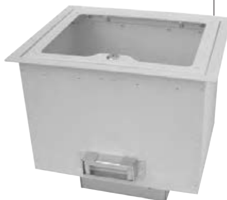
Wireless Access Point Enclosure