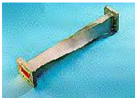
D112CCSG 90° Rigid Twist for WR112, 7.05–10.0 GHz, with interface types CPR112G and CPR112G, 10 in, gray