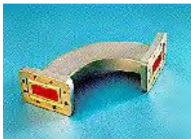
H112MC102C102SG 90° H Plane Swept Bend for WR112, 7.05–10.0 GHz, with interface types CPR112G and CPR112G, 102 mm x 102 mm, gray