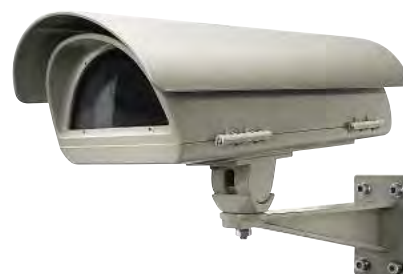
VERSO COMPACT + WBJA