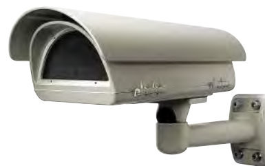
VERSO COMPACT + WBOVA2