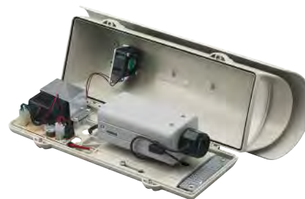
VERSO COMPACT + CAMERA