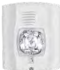
CHSW White Chime Strobe