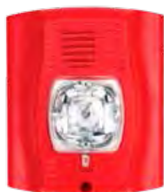
CHSR Red Chime Strobe