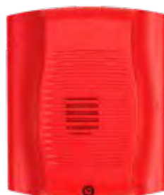
CHR Red Chime