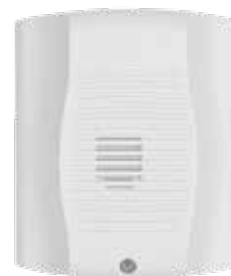
CHW White Chime