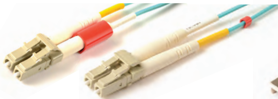
LC Duplex Fiber Jumper