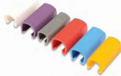
Highly Visible and available in 8 Colors