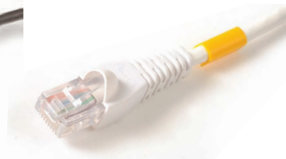
MC5® Category Copper Cable