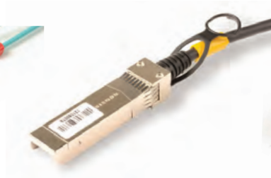
SFP+ Copper Cable