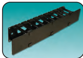
RS3-RWM-1* .....Single Sided 19" cable manager, 1U, dual hinged/removable cover

Designed for use with Siemon's RS Series Rack and Vertical Patching Channels.