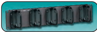
WM-144-5.....Five S144 hangers, 2U