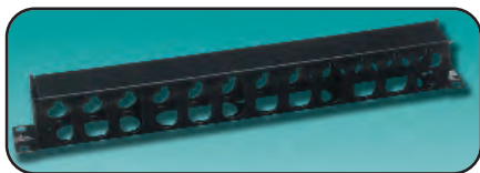
RWM-1 .....Single-sided horizontal, with cover,1U

The multi-access horizontal cable manager design provides cable management for both the front and rear of the rack, is compact in size (1 RMS). The managers feature high capacity slots for entering and exiting cables with a single piece removable cover.