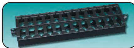
RWM-1DS.....Double-sided horizontal, with covers,1U