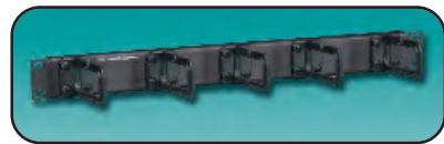
WM-143-5.....Five S143 hangers, 1U

The WM series cable managers provide increased strength and to eliminate interference with panels mounted above or below. They are an economical solution for providing a clean and simple means of organizing small-to-large bundles of cables and patch cords.