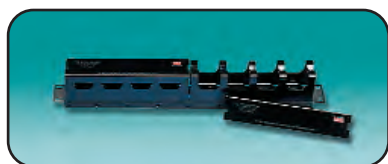
S110-RWM-01 .....1U, with covers, black

When mounted on a 19 inch panel for rack installation, our S110-RWM and S110-RWM2 cable managers provide superior cable management in a compact space. Covers are included with the cable managers to provide a clean patching environment.