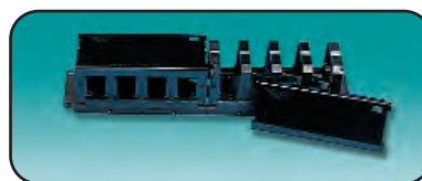
S110-RWM2-01 .....2U, with covers