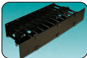
RS3-RWM(X)-2* .....Single Sided 19" cable manager, 2U, dual hinged/removable cover