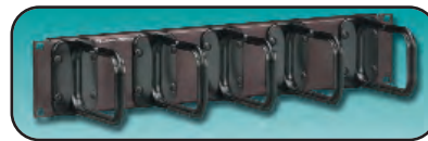
WM-145-5.....Five S145 hangers, 2U