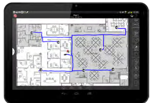
Markups and pushpins