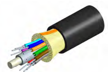
760037390 | P-024-OD-5L-FSUBK Indoor/Outdoor Plenum Distribution Cable, 24 fiber single-unit