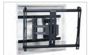
Combine with the INW-AM325 in-wall box for a flush installation