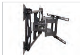
AM175 offers flat-panel displays 10° of tilt and 45° of swivel