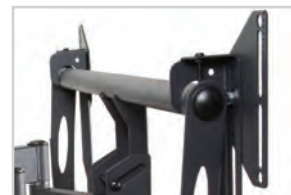
Patented Griplates™ hold the display tight on its mounting brackets