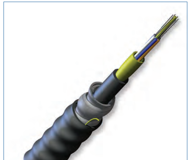
Part Number: 006E8P-31131-A3

NFPA 262 (for plenum, riser and general building applications)