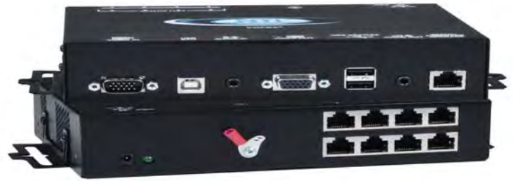
VOPEX-C5USBVA-8 Local Unit (Front & Back)

The VOPEX® VGA USB KVM Splitter/Extender allows up to eight remote users (8 USB keyboards, mice, and VGA monitors) to access one USB computer (PC, SUN, MAC) located up to 1,000 feet away using CAT5/5e/6 cable. Audio can be broadcasted to self-powered stereo speakers at the local unit and each remote location.