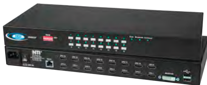
UNIMUX-DVI-16HD (Front & Back)

The UNIMUX™ High Density DVI USB KVM switch allows you to control up to 32 single link DVI or HDMI USB computers with one DVI-D monitor, USB keyboard and USB mouse.