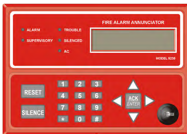
SK-5235 Remote Annunciator

Users identify themselves to the control panel by entering a code on the annunciator. When a user presses a button, the annunciator piezo beeps and the LCD prompts the user to enter a code or other relevant information.