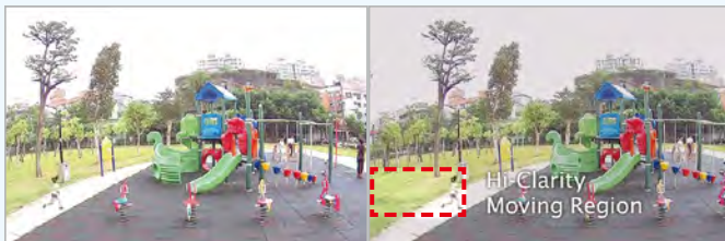
Without Smart Stream II