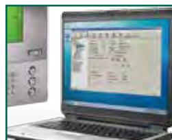
pc programmable easy to use software included