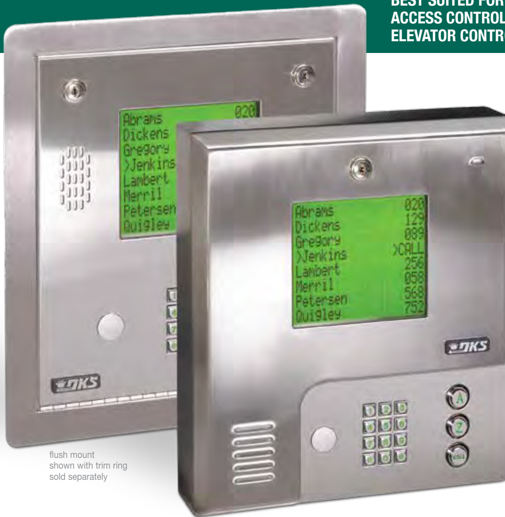
flush mount shown with trim ring sold separately

BEST SUITED FOR APPLICATIONS REQUIRING COMPLETE ACCESS CONTROL FOR UP TO 16 ENTRY POINTS, INCLUDING ELEVATOR CONTROL