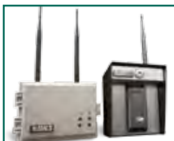
wireless expansion up to 24 entry points