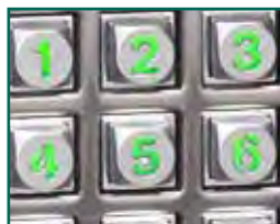
internal LED lit keypad and A-Z-CALL buttons