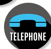
voice and remote programming use DKS service options for connection and programming