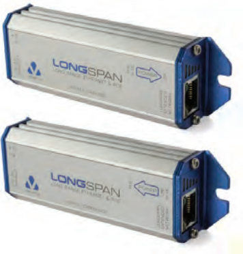
Example 1. LONGSPAN BASE and CAMERA are sold separately.

For network-only applications, the same non-POE model is fitted at each end of the link. For network and power delivery, Base and Camera POE units are used together. A POE switch or separate POE injector may be used as the Base power source. Maximum power and range is achieved with the optional 57V Veracity PSU, enabling the LONGSPAN Base unit to become the POE injector for the link.