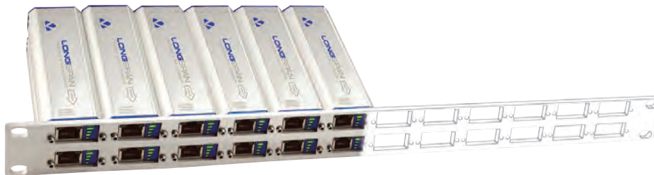
Up to 24 LONGSPAN units can be mounted in a 1U rack space.