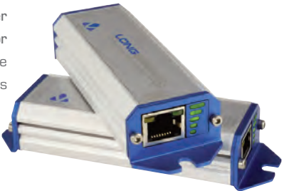
Example 2. Smart LED display shows SafeView™ technology.

NOTES: Range is for typical 24AWG Cat 5e or 23AWG Cat 6, 4-pair UTP | For other cables types, or any installations over 600 metres length, consult Veracity for recommendations or test on site | Distances may be increased by connecting multiple links in series | Data rate at full range stated: 100Base-T=200Mbps, 10Base-T=20Mbps