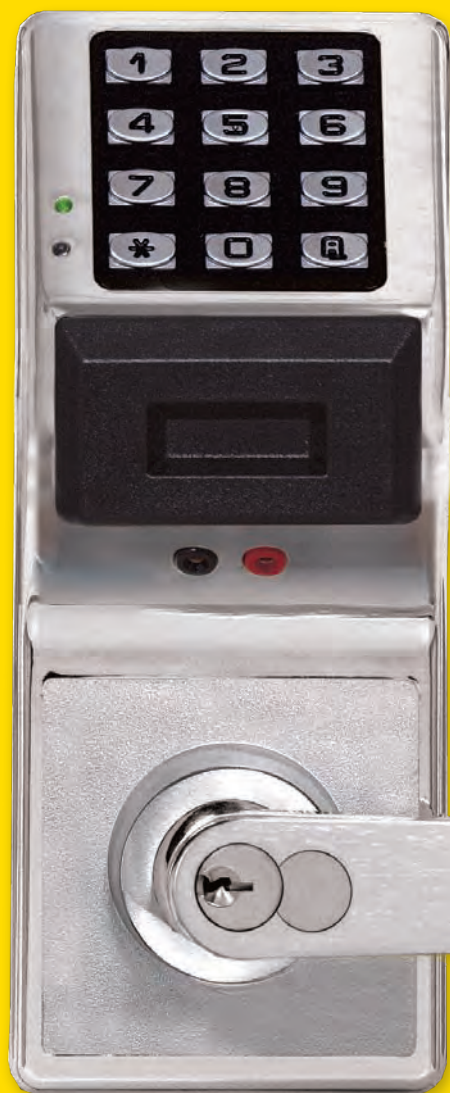
PDL5300IC Prox/PIN Lock front/back view, shown

Double-sided Trilogys for PIN code or prox access from 2 sides of the door