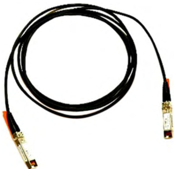
Figure 3. Cisco direct-attach twinax copper cable assembly with SFP+ connectors

Cisco SFP+ Copper Twinax (Figure 3) direct-attach cables are suitable for very short distances and offer a cost-effective way to connect within racks and across adjacent racks. Cisco offers passive Twinax cables in lengths of 1, 1.5, 2, 2.5, 3 and 5 meters, and active Twinax cables in lengths of 7 and 10 meters.