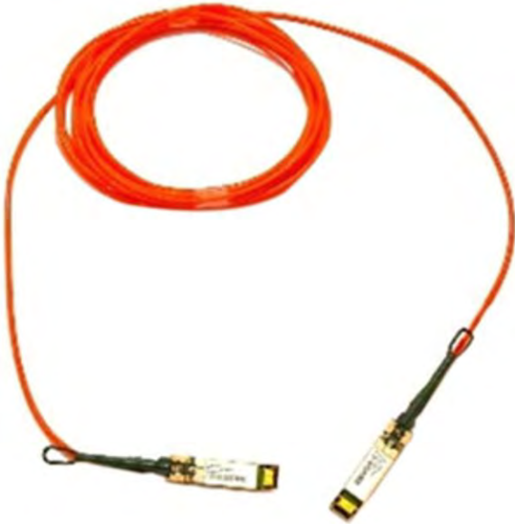
Figure 4. Cisco direct-attach active optical cables with SFP+ connectors