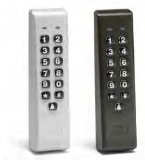
212iLM / 232iLM / SSW-iLM