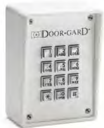
212R / 232R