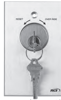
960 Shown with Screen Printed Reset/Override Option