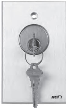
Shown with Standard Faceplate