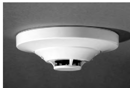
SK-Heat (base included)

SK-Heat: Fixed temperature alarm 135°F (57°C)