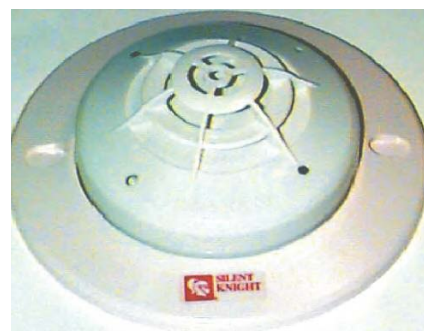
SD505-AHS Heat Detector