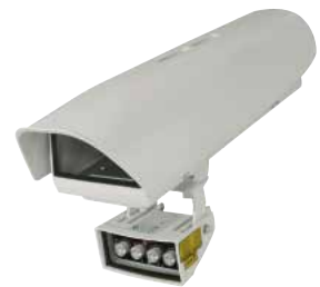
HOV HI-POE IPM + GEKO IRH