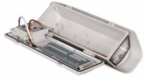
HOV HI-POE IPM

The IPM system offers an opportunity to refit analogue systems with already installed housings by simply changing the slide and internal electronics. This enables the digital conversion, speeding up the installation and thereby minimizing costs and environmental impact.