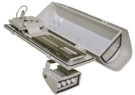
HOV HI-POE IPM + GEKO IRH