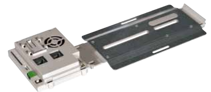
MODULE IPM (INTELLIGENT POWER MANAGEMENT)