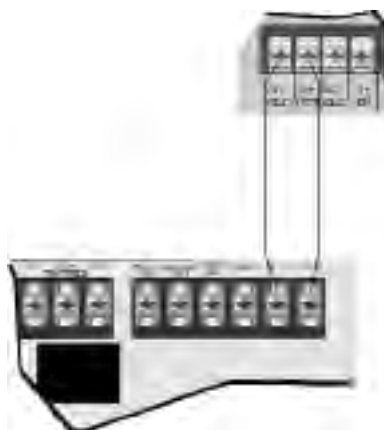
Class B (Style 4) Wiring