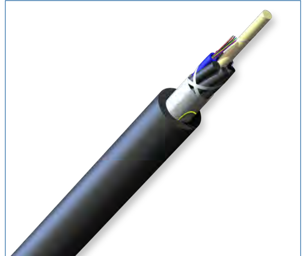
Part Number: 012TUF-T4180D20