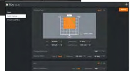
Coverage Area Setting