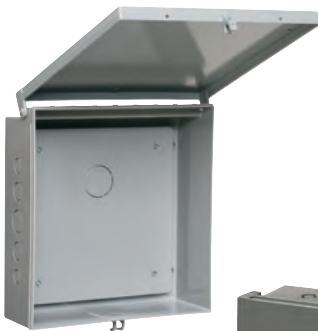
EB1212BP Back plate installed

For outdoor use, box must be mounted with hinge on top.