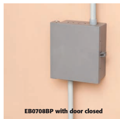
EB0708BP with door closed