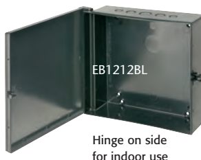
Hinge on side for indoor use