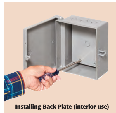
Installing Back Plate (interior use)