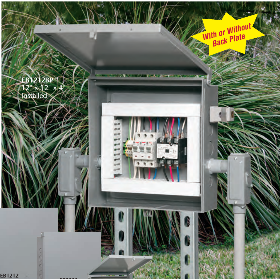
EB1212BP 12" x 12" x 4" Installed

Non-metallic • Protect Devices, Backups and More!