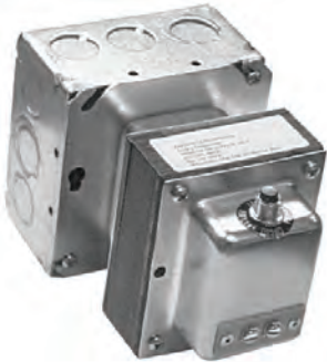
Model 95T-16 Shown attached to standard junction box.