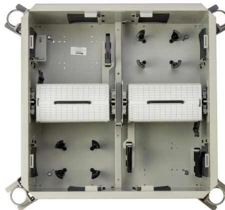
FLEX-ZRFEG - Top view