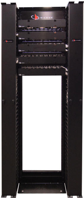
Fully compatible with Siemon's wide range of vertical and horizontal cable managers.

Siemon offers a full range of accessories to allow further customization of Siemon racking systems.