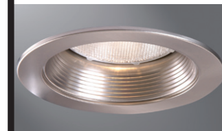
5001SN Satin Nickel Trim, Satin Nickel Baffle