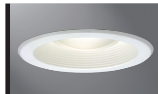
5001P White Trim, White Baffle