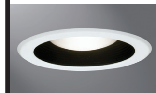
5001MB White Trim, Black Baffle