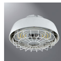
WG Wire Guard