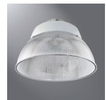
CLR Clear Reflector