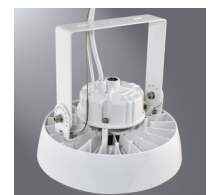
SMB Surface Mount Bracket