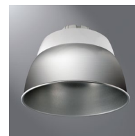
ALR Aluminum Reflector