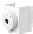
AVM-P-CMT (Junction Box Not Included)