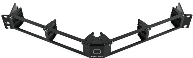
Angled Patch Panel